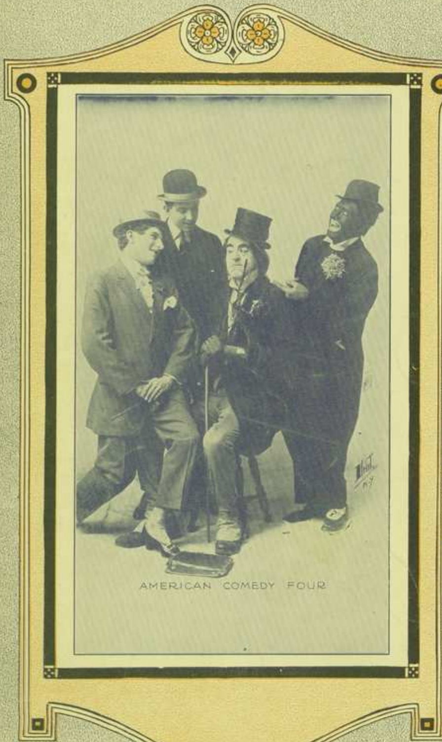
AMERICAN COMEDY FOUR